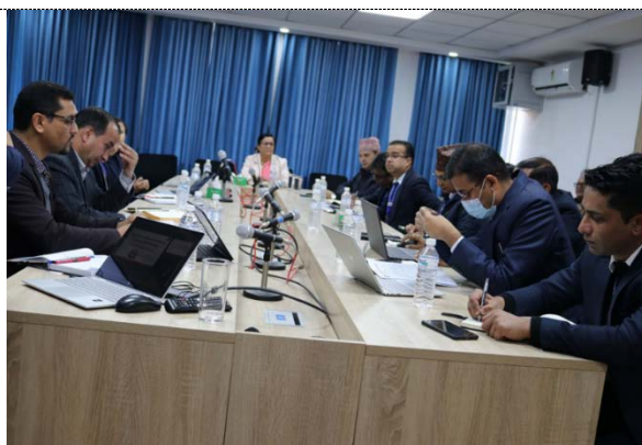
Photo details: Consultation meeting on provincial public health act