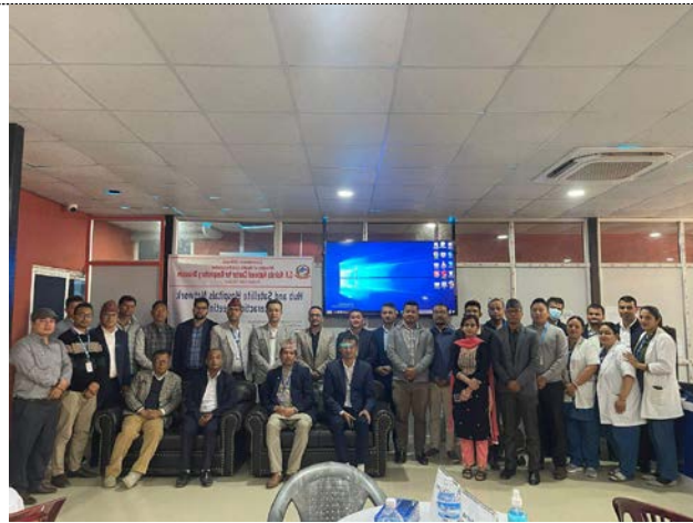
Group photo of Hub and Satellite Hospitals network interaction meeting