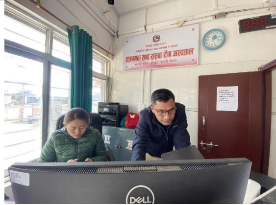
Orientation to the staffs of ICDH on upgraded EMR