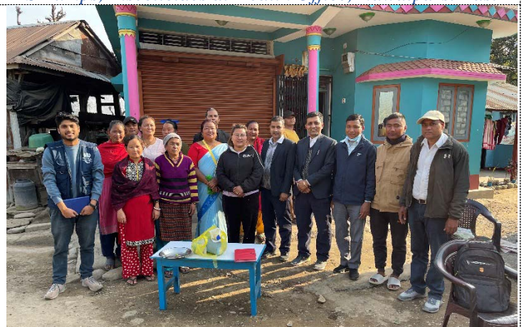
conducted active case detection at Dharesimal, ward no 11 Madhyabindu Municipality, Nawalparsi East.