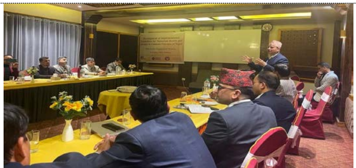
Photo Details: MoSDH Secretary delivering his speech in the stakeholders' engagement meeting for menstrual health and justice