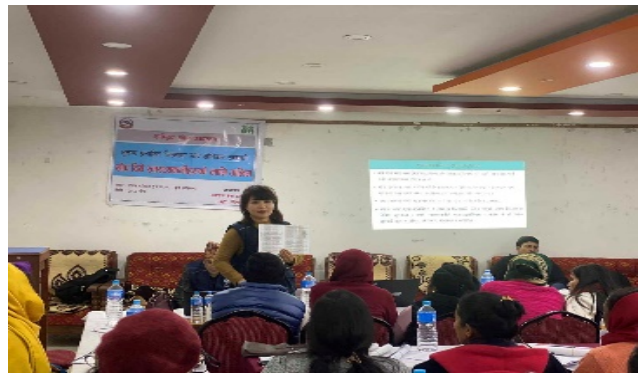
Technical assistance in district microplanning workshop and 4 batches of vaccinators training on MR and TCV SIA