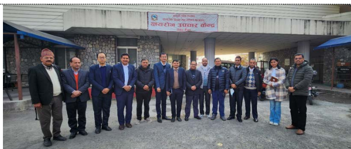
Photo Details: Meeting with stakeholders to discuss and recommend the strategic action point for Active Case Finding of TB cases