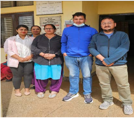
Monitoring and supervision of NCD and MH programs at Lamjung district