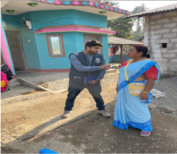
Oriented FCHV about Kala-azar during case-based surveillance