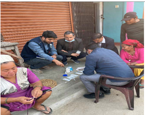
Screened Kala-Azar test at Madhyabindu Municipality, Nawalparsi East, Gandaki.