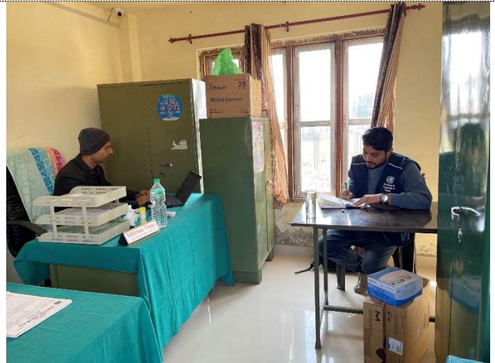
Preparedness of IRS activity including trained personnel, IRS Pumps, Insecticides at Health Office, Nawalparsi East