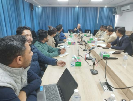
Photo Details: WHO Courtesy meeting with MoSDH Secretary and other officials and WHO Team