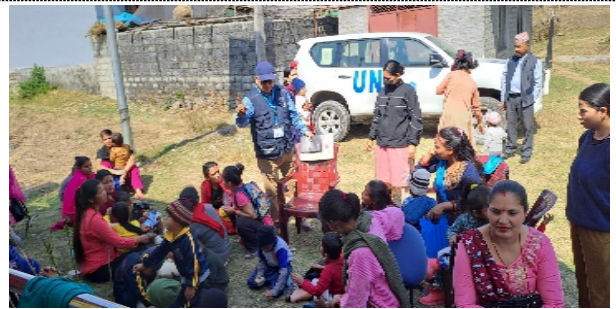
MR SIA Session site monitoring at Manang and Tanahun districts